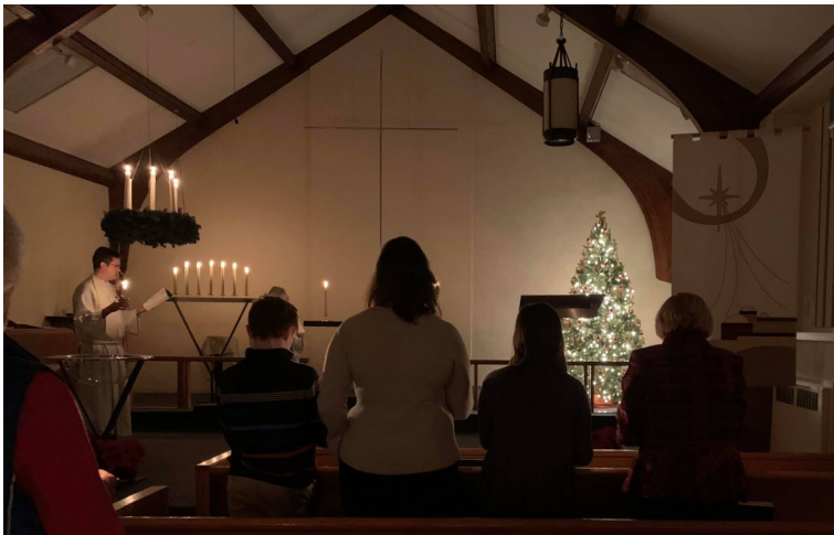
Christmas Eve Candlelight Service