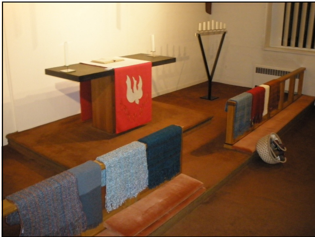
Prayer Shawl Blessing November 6, 2011

A Prayer Shawl Blessing was held on November 6. Blessed shawls were presented to: