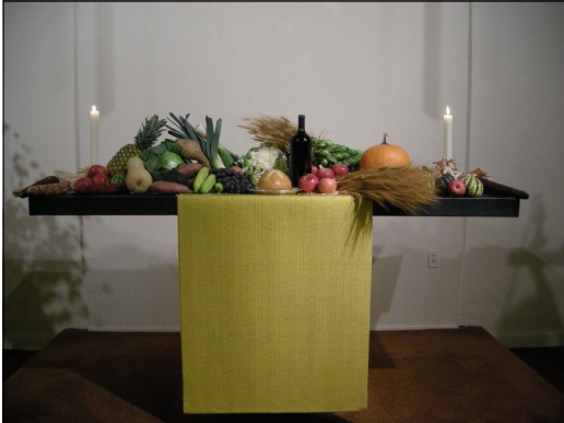
Harvest Altar on Thanksgiving Eve