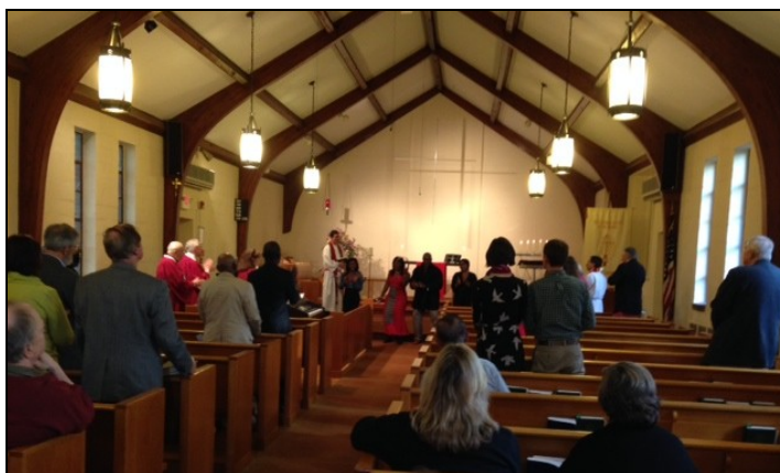
Bethany Lutheran Church members from Liberia led us in African worship music.

Messiah celebrated Reformation Sunday with members of nearby LCMS congregations: Bethany (Ewing), Grace (Palisades Park), Hope (Levittown, PA), and St. Peter (Lambertville).