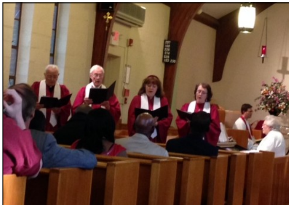
Choir of Bethany Lutheran Church, Ewing

Messiah celebrated Reformation Sunday with members of nearby LCMS congregations: Bethany (Ewing), Grace (Palisades Park), Hope (Levittown, PA), and St. Peter (Lambertville).