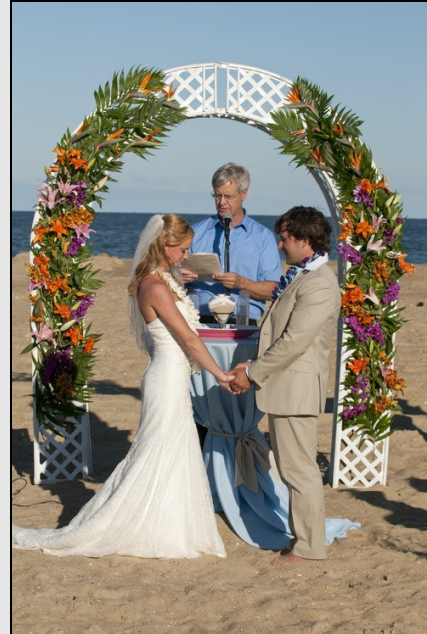
Wedding on Bethany Beach, DE