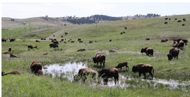
Bison (above) and bears (below), oh my!