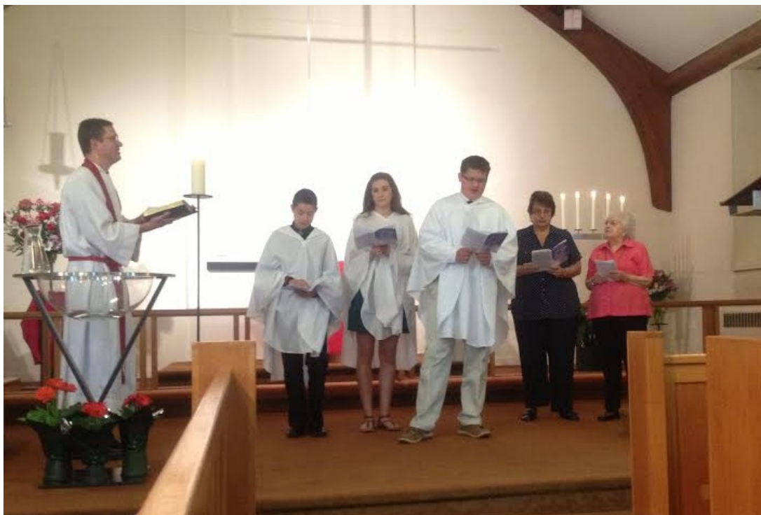
Confirmation on Pentecost Sunday, May 24.