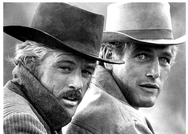
You'd think they'd have nothing to offer.

Visit our website to listen to audio recordings of Sunday Sermons.