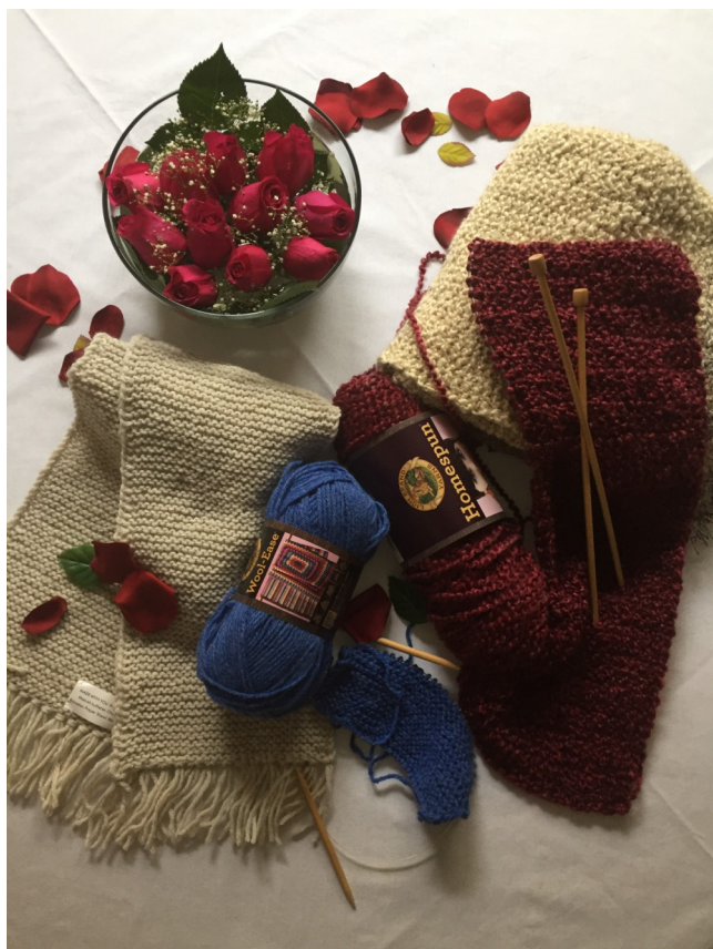
Some of our finished and 'in-the-making' shawls and scarves.

Please join our group of knitters/crocheters. We provide yarn, needles and a good spirit. If you haven't knit or crocheted for a while, don't get discouraged, we all will help you to get started.